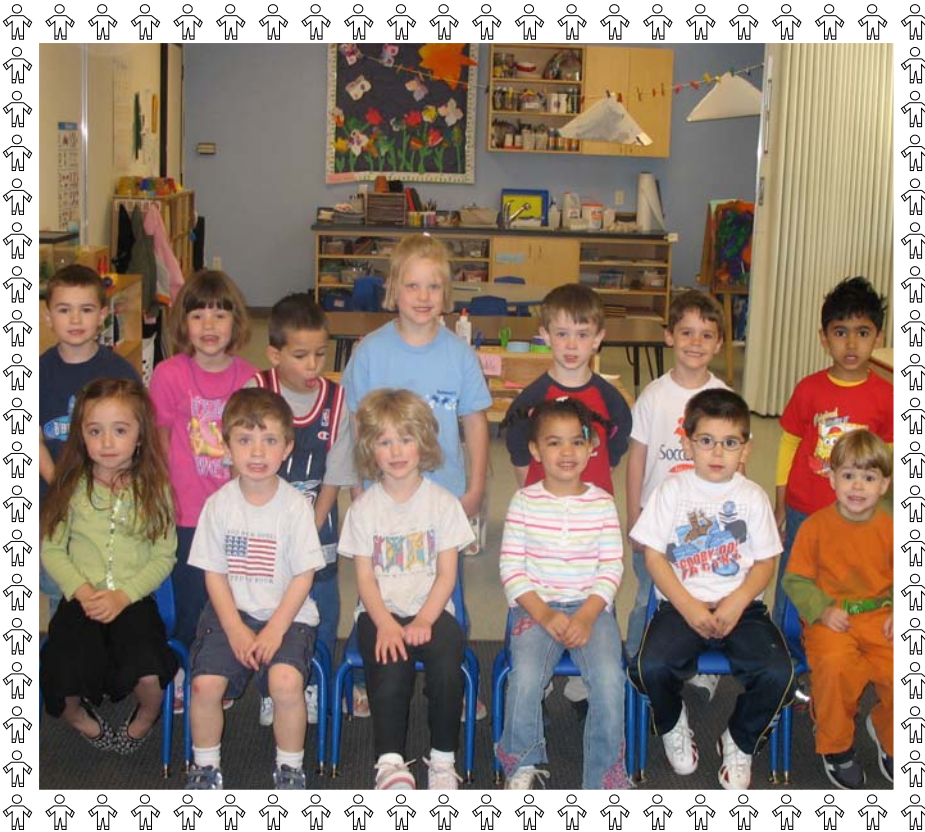
CTK Preschool Children

You can pick up an updated church directory from the table in the narthex. Check to see that all your information is correct and call the church office if you need to update any information on your address or email address.